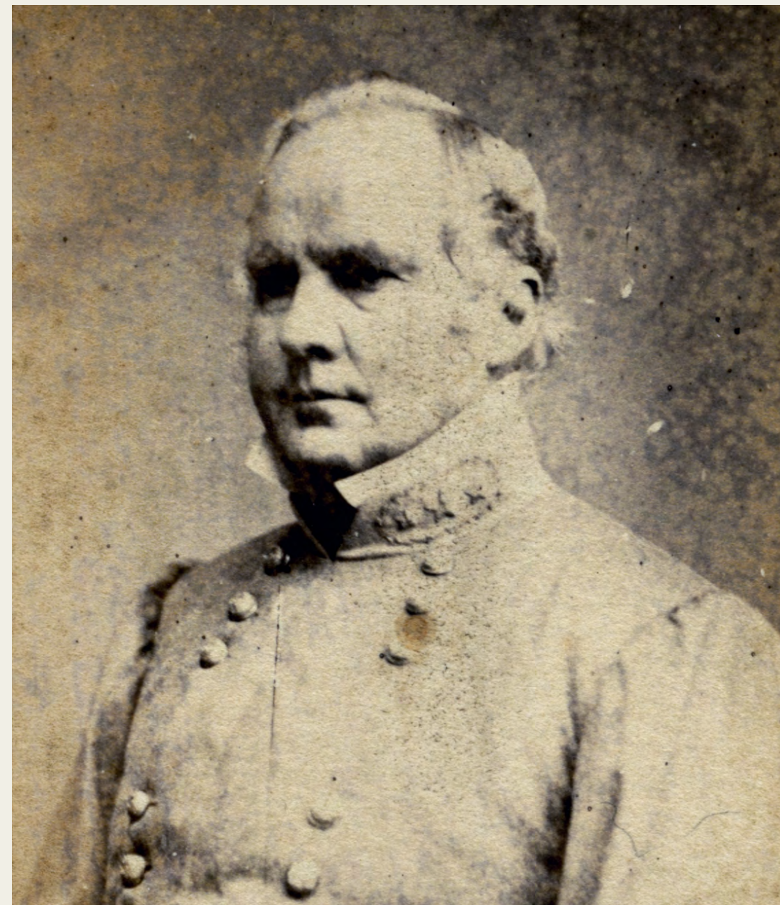
Maj. Gen. Sterling Price, C.S.A.

In August 1864, Confederate Maj. Gen. Sterling Price led an expedition from Arkansas into Missouri. The raid had several objectives: to capture St. Louis, divert Union manpower from the East, recruit Missourians for the Confederates, and obtain military supplies. The raid went badly. St. Louis and Jefferson City were well defended, so Price decided to capture Kansas City. On October 23, Price's troops assaulted a strong Union defensive position held by Maj. Gen. Samuel Curtis at Westport, across the river from Kansas City. The Confederates retreated after a four-hour battle, leaving some 1,500 dead and wounded on the field.