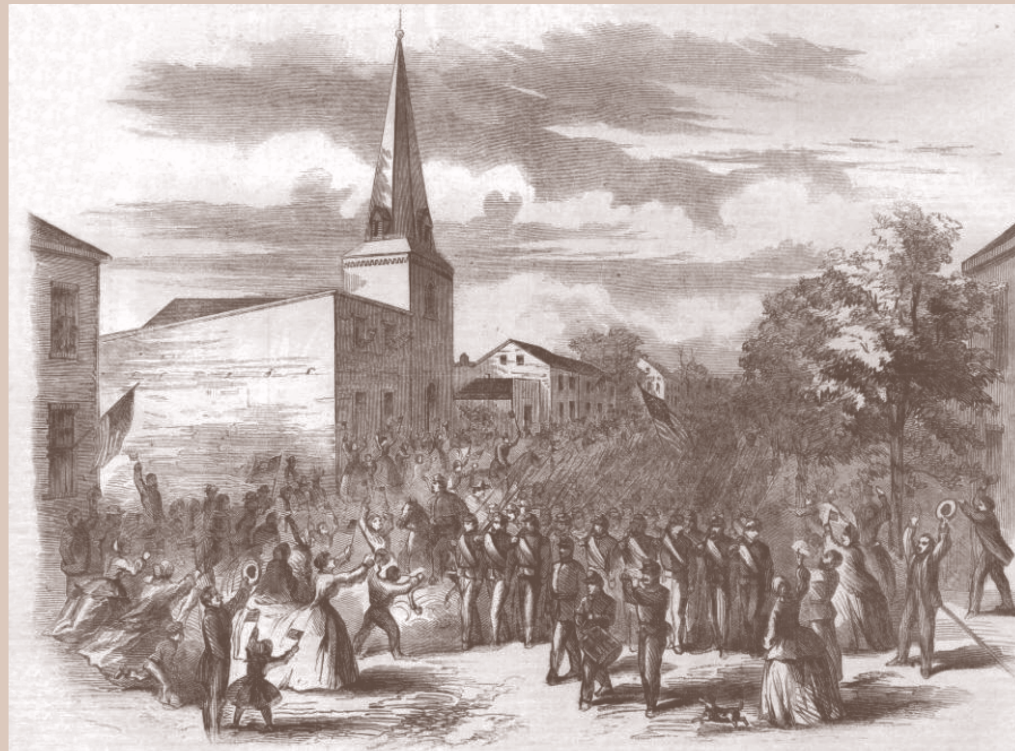
Union troops enter Danville just before the October 8, 1862, Battle of Perryville. Harper’s Weekly (November 8, 1862).

Confederate Gen. Braxton Bragg invaded central Kentucky in summer 1862 with the goal of occupying it and mobilizing more troops for the South. Union Gen. Don Carlos Buell met Bragg’s troops at Perryville, 10 miles west of here. The October 8, 1862, Battle of Perryville resulted in 7,000 casualties, a number that overwhelmed the hamlet with dead and wounded.