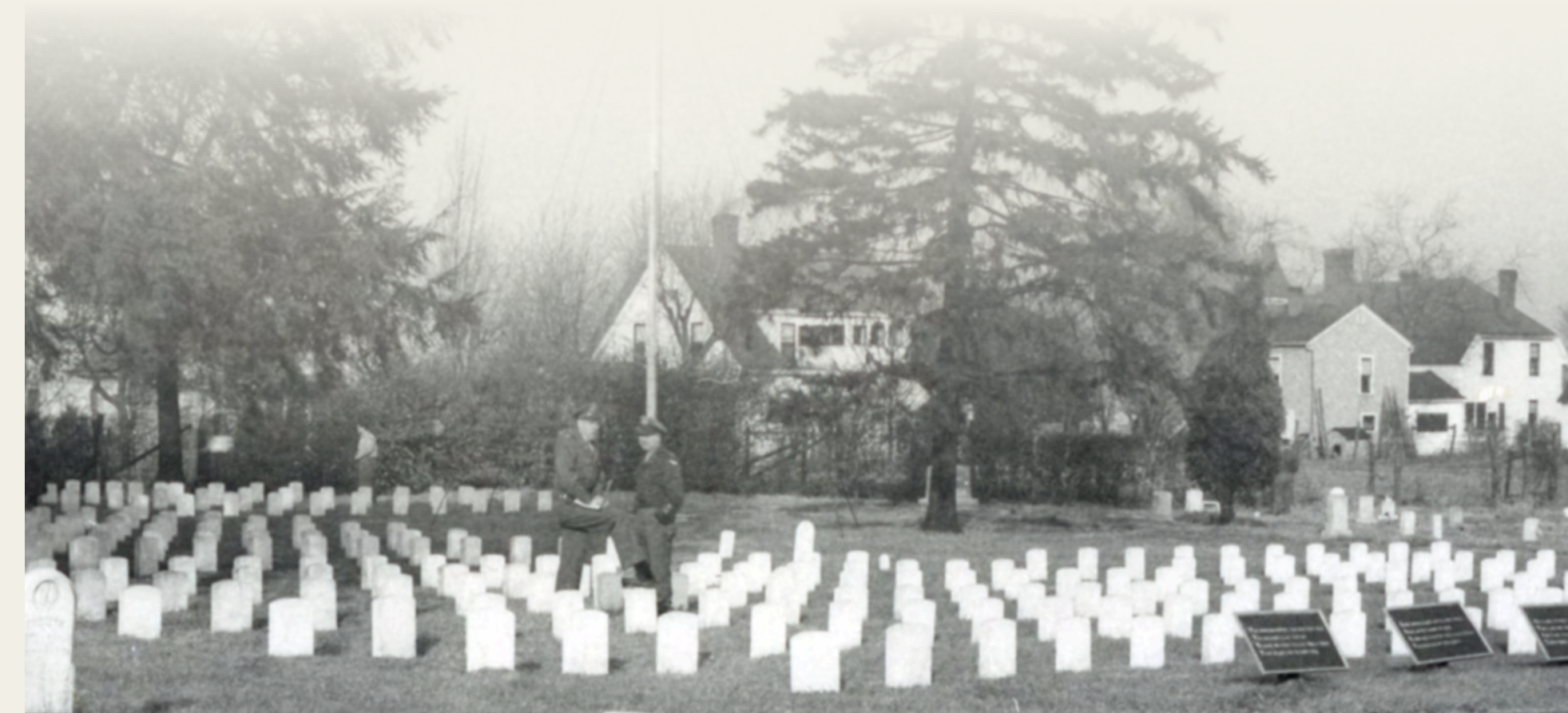
Danville National Cemetery, c. 1940. Headstones in the private Danville Cemetery are visible in photograph, back right.