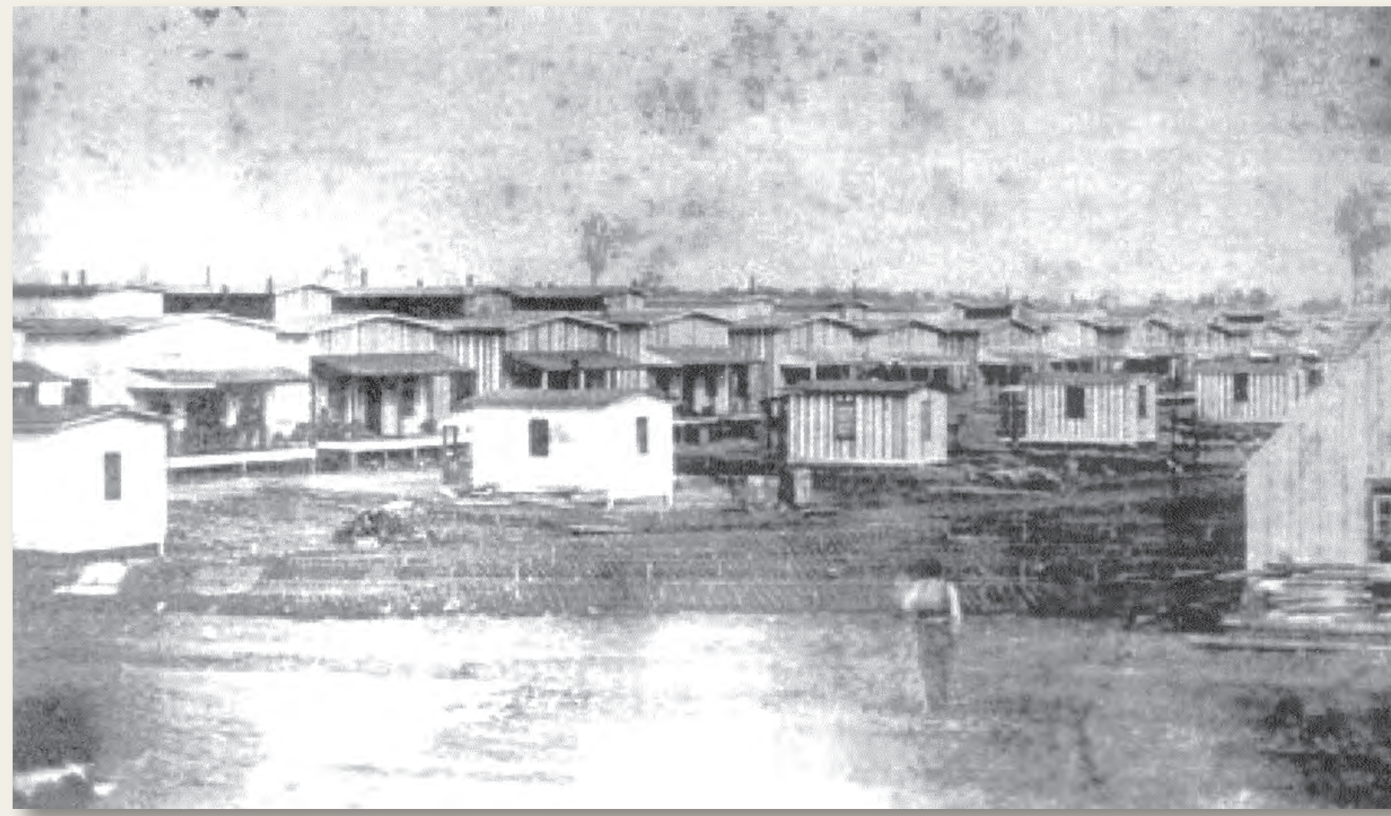
Camp Chase, c. 1864.