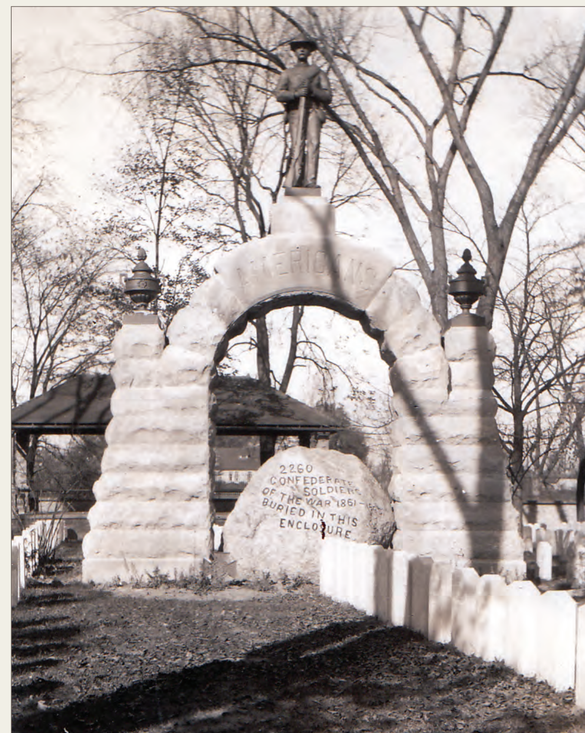
The monument, c. 1940. Urns on either side of the soldier were replaced later.

In 1908, after determining that individual graves could be identified, the Commission for Marking Graves of Confederate Dead installed headstones. The Commission also erected metal fencing atop the stone wall and the decorative entrance gate to better secure the cemetery.