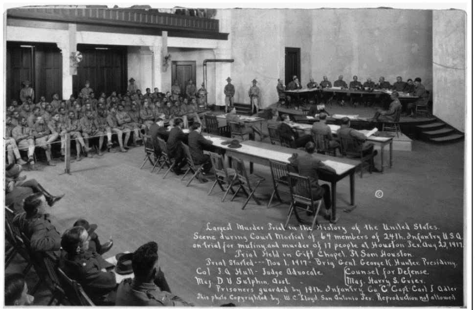
Courtroom scene during the first trial of those charged in the riots of August 23, 1917.

False reports that Baltimore had been killed at the hands of white police incited some soldiers from the 24<sup>th</sup> to demand his release. That evening, the rumors led an estimated 150 men of the 24th Infantry to march two hours into Houston. The riot that ensued left sixteen white civilians dead, including four policemen and two National Guardsmen. Four black soldiers died, two of whom were accidently shot by their comrades.