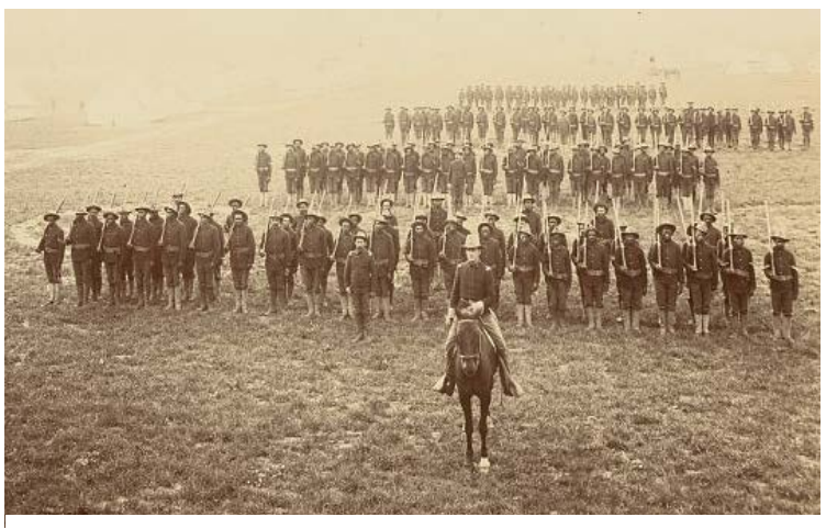
African American soldiers at Camp Meade, PA, 1899.

The 10-month-long Spanish-American War of 1898 resulted in Spain relinquishing its claim on Cuba, and ceding Guam, Puerto Rico, and the Philippines to the United States. Significant battles were waged, but the best known in popular history is the charge up San Juan Hill that took place July 1, 1898, in Cuba, because of Teddy Roosevelt and his "Rough Riders." Yet an estimated 200,000 volunteers and National Guard units fought in the Spanish-American War, including 3,339 African-American regulars and about 10,000 volunteers.