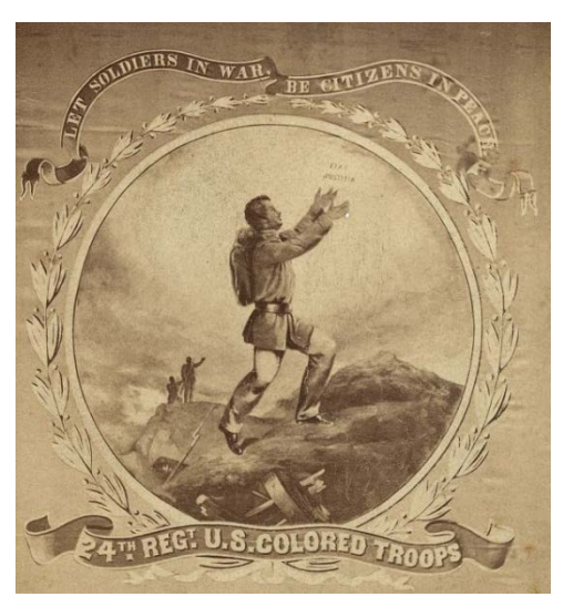
Detail of carte de visite of a US Colored Troops regimental flag and motto, ca. 1862.

During the Civil War, 179,000 African Americans are estimated to have served as part of six units of U.S. Colored Troops (USCT), segregated into 175 regiments. These were the first organized units for black soldiers and these men, many formerly enslaved, enthusiastically volunteered to fight for the Union. As soldiers they fulfilled combat and labor functions. By the war's end, black soldiers represented 10 percent of the Union Army and about 25 percent of the naval force.