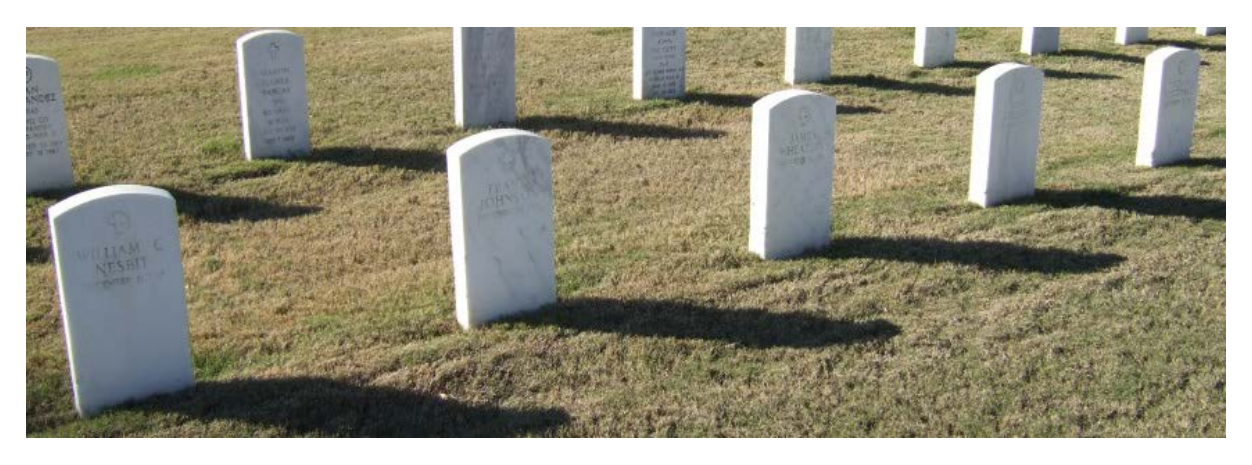
Graves of 17 Houston Riot victims buried at Fort Sam Houston National Cemetery.

While African-Americans continued to face discrimination at home, in their civilian and military lives, on the battlefields abroad their service was recognized and appreciated. Established regiments of black soldiers – the cavalry and infantry honorifically known as Buffalo Soldiers – were posted to the U.S.-Mexican border in the 1910s, but individuals from those regiments and new enlistees joined the war effort in Europe in other divisions. Members of the 25<sup>th</sup> Infantry Regiment, for example, fought with French troops on the front lines as part of the 93<sup>rd</sup> Infantry Division.