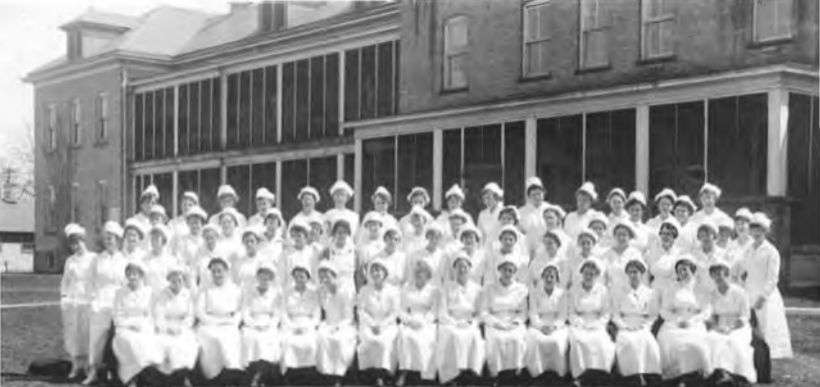
NURSE CORPS U.S. GEN. HOSPITAL NO. 28 FORT SNELLING MINN.