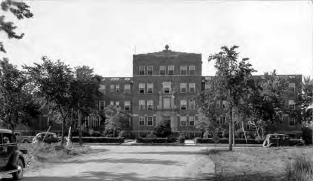
ST. JOSEPH'S HOSPITAL MITCHELL, S.D. 3762