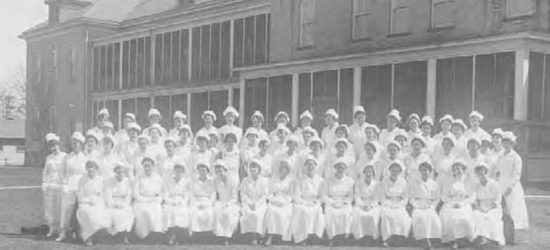
NURSE CORPS U.S. GEN. HOSPITAL NO. 20 FORT SNELLING MINN.