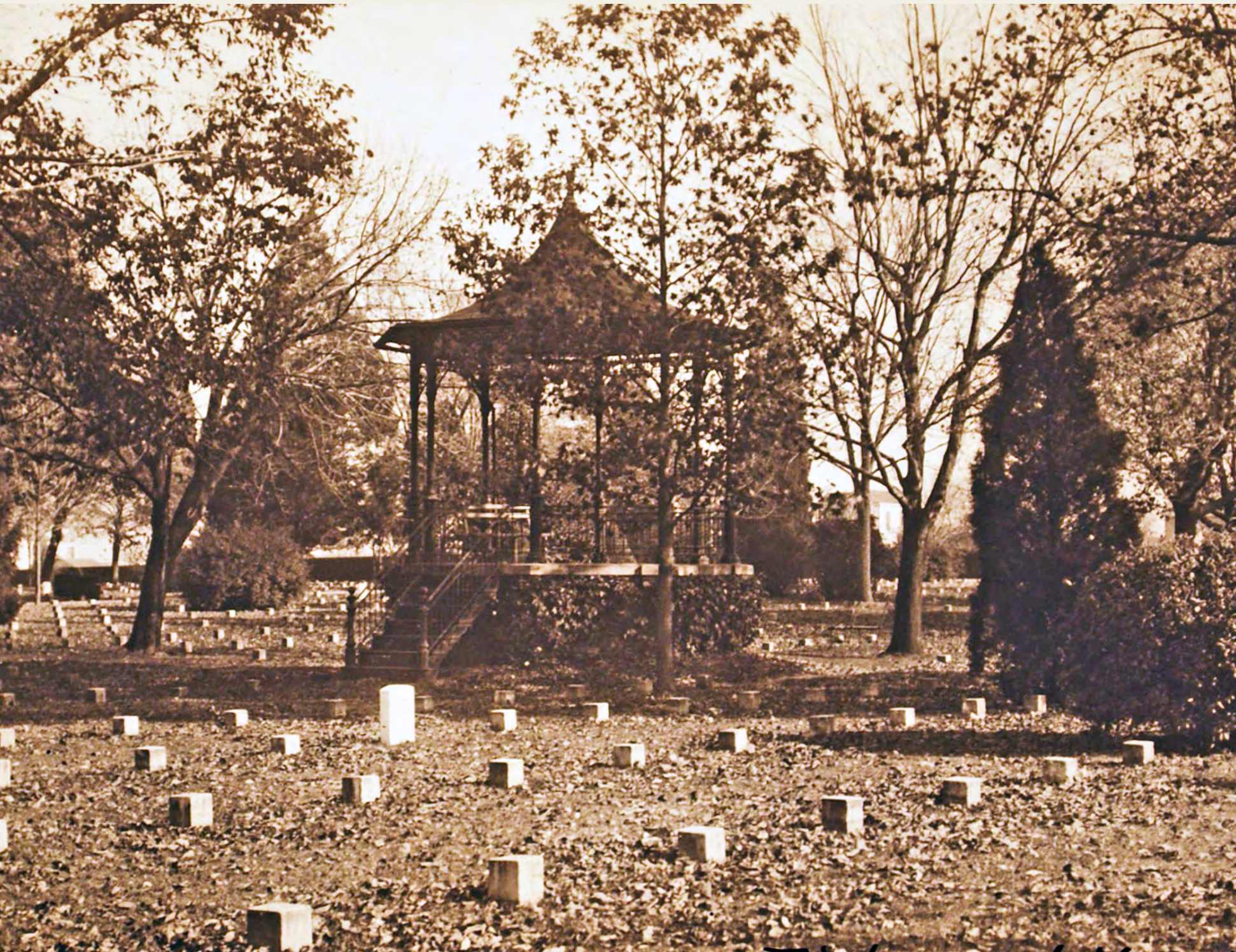
The rostrum, built 1888, with unknown grave markers in foreground, 1908.

To learn more about benefits and programs for Veterans and families, visit www.va.gov