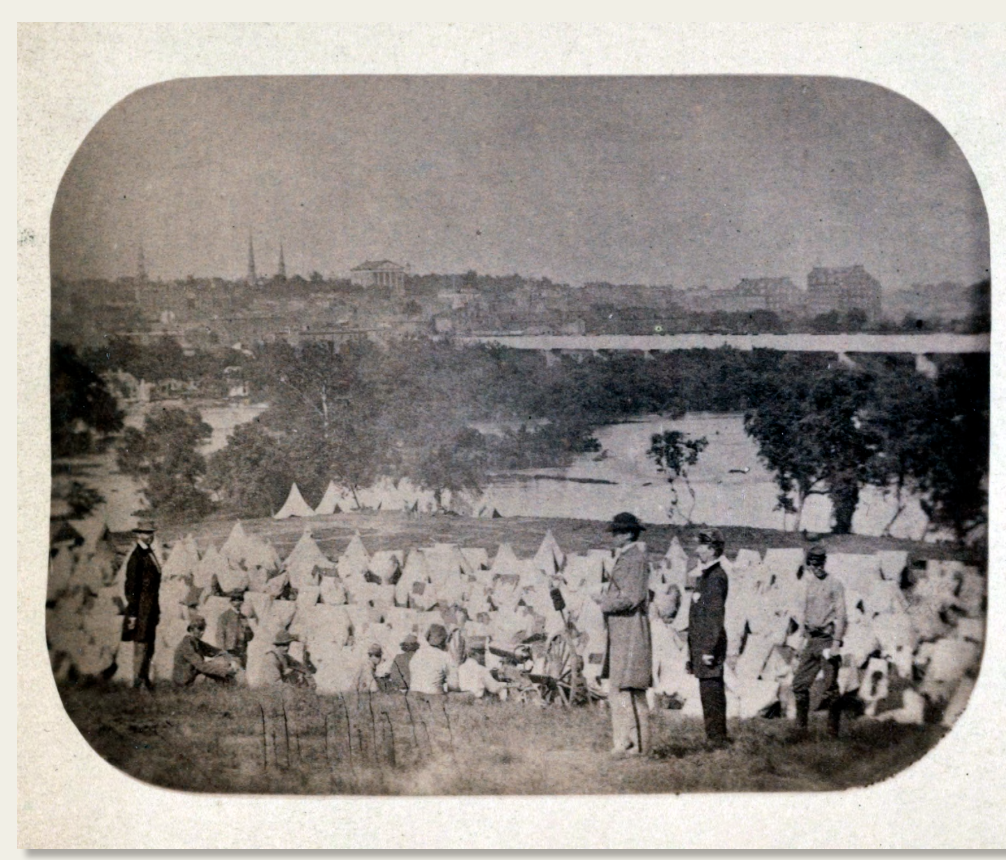
Union prisoners were housed in tents on Belle Isle, c. 1864.

During the Civil War, Union and Confederate armies fought multiple battles for control of Richmond. Thousands of Union soldiers perished. They are now buried in Richmond National Cemetery and six other national cemeteries established in the Richmond-Petersburg area in 1866.