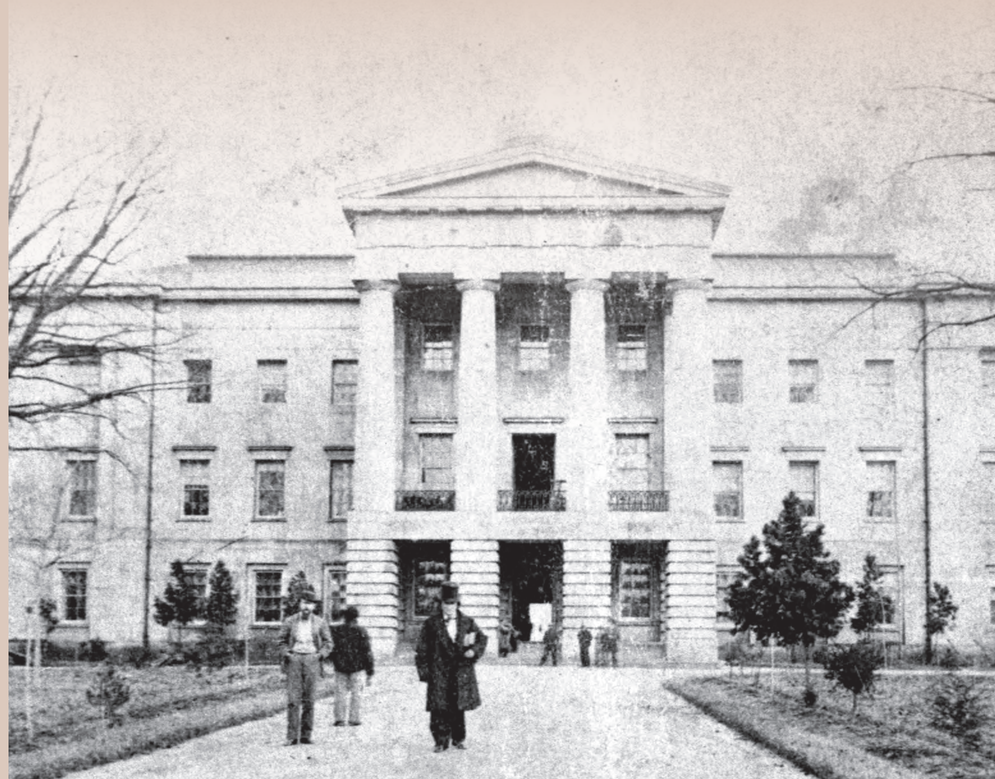
North Carolina State Capitol, 1861.