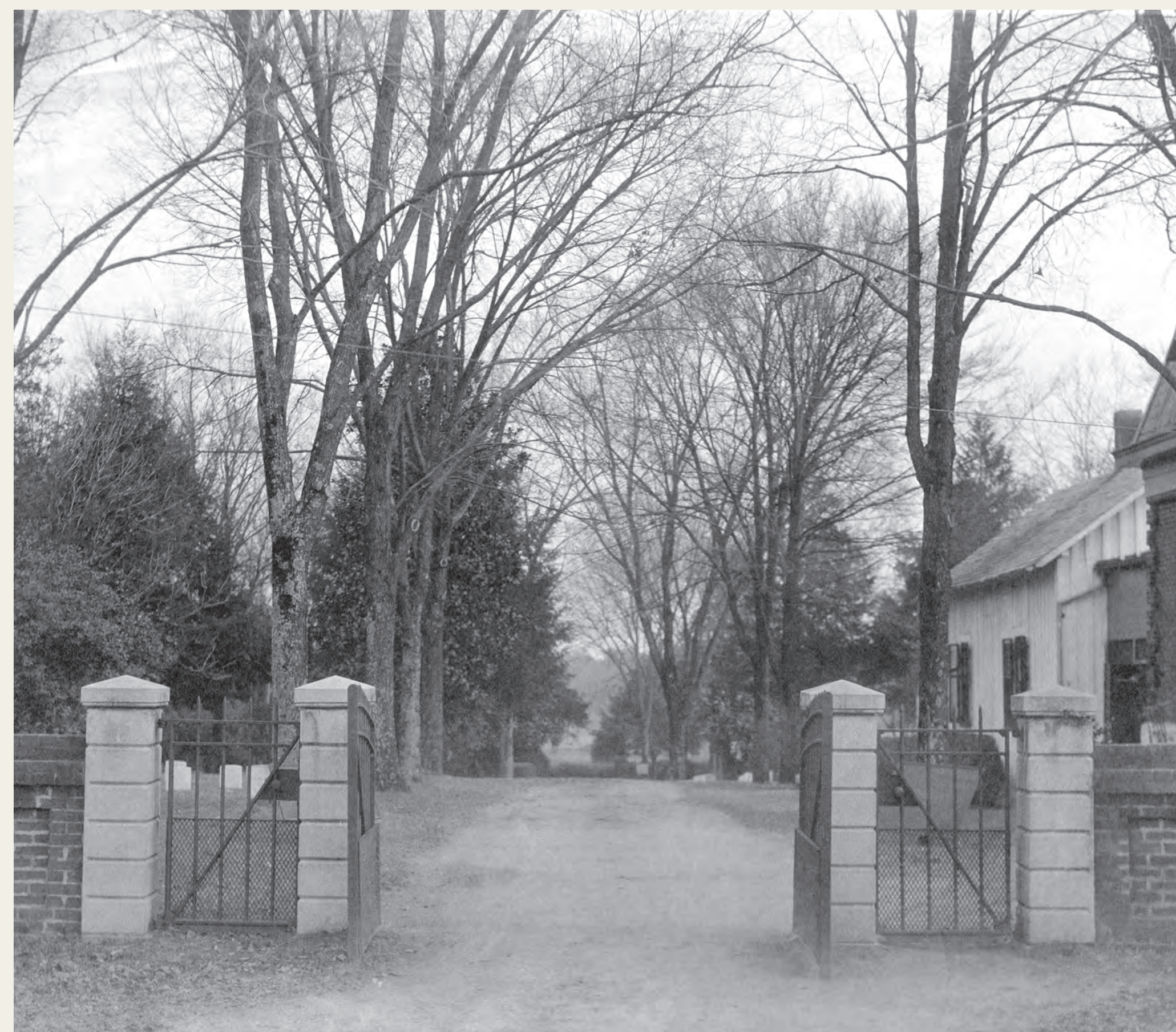
View into cemetery, 1904. Visible on right is the original wood-frame lodge, reused as a kitchen and tool-house after the new brick lodge was built in 1874.

The remains of 1,173 soldiers were reinterred here from other locations in Raleigh; the Averasboro, Bentonville and Goldsboro battlefields; and elsewhere in the state. Volunteer regiments from thirteen states are represented, and were buried together. Other sections were set aside for U.S. Army Regulars and U.S. Colored Troops. Four sections contain 547 unknown soldiers.