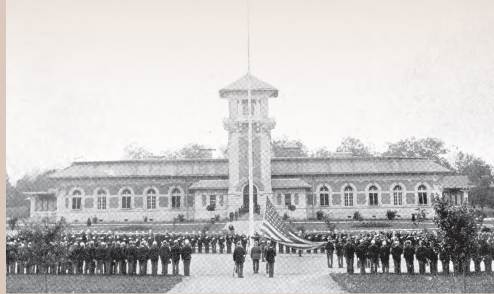
Mountain Branch, National Home for Disabled Volunteer Soldiers, c. 1910.