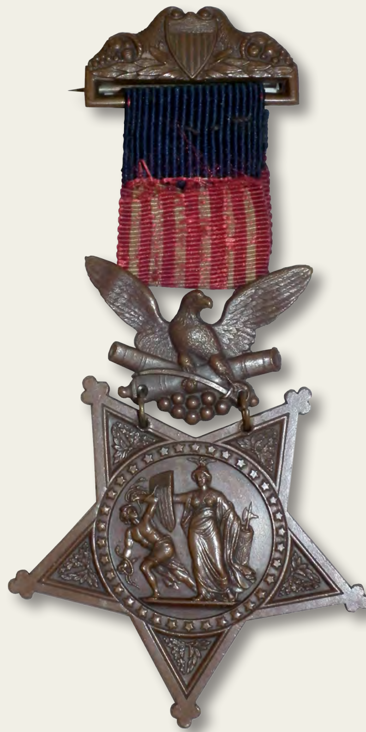
Civil War Army Medal of Honor. Gettysburg National Military Park.

Three Civil War Medal of Honor recipients are buried here. First bestowed in 1863, it is the highest award for military valor in the U.S. Armed Services. For acts above and beyond the call of duty, 1,522 individuals who served in the Civil War received the medal.