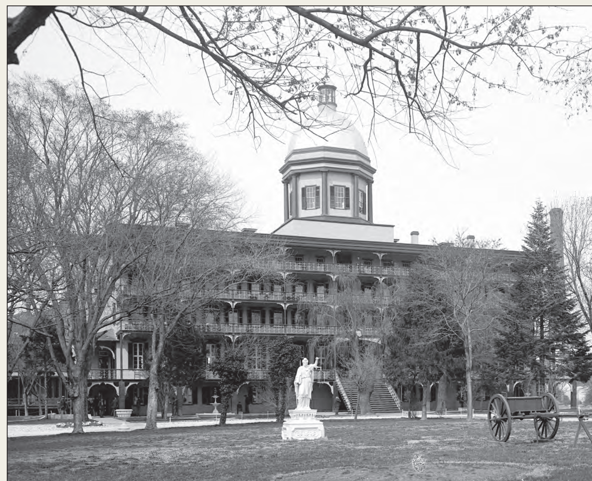
Hospital building at the Southern Branch of the National Home for Disabled Volunteer Soldiers, 1902.

The old hospital became part of a sprawling campus. Its buildings included a theater, library, chapel, and beer hall. Operated like the military, barracks at the National Home had company designations and men wore uniforms. It was initially open to disabled veterans of the Mexican and Civil wars who received pensions of less than $16 per month.