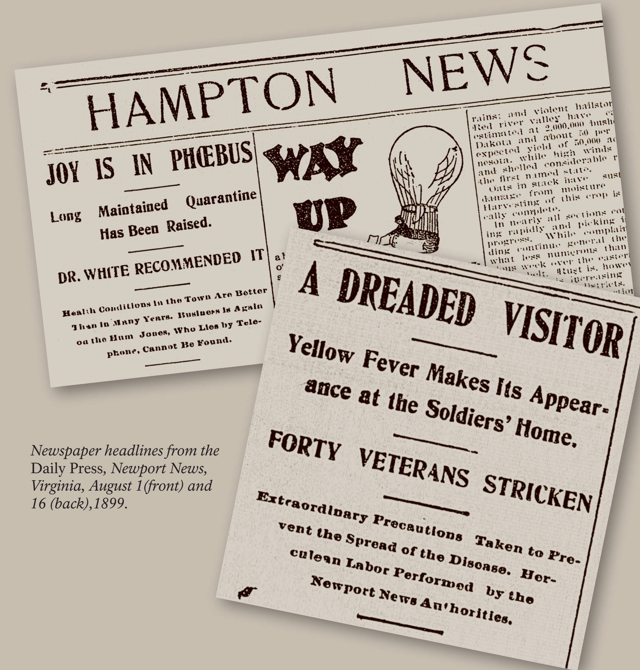
Newspaper headlines from the Daily Press, Newport News, Virginia, August 1 (front) and 16 (back), 1899.