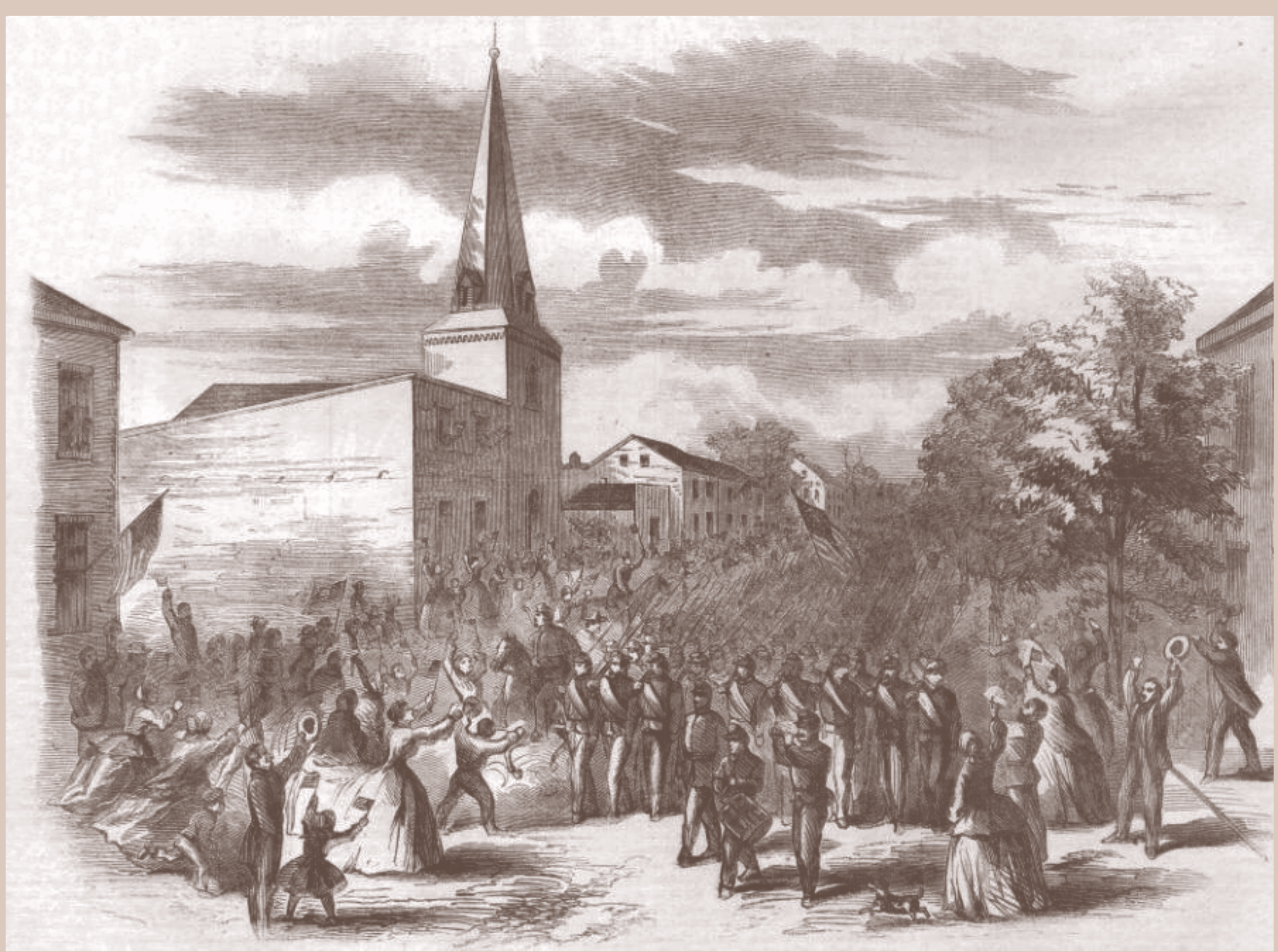
Union troops enter Danville just before the October 8, 1862, Battle of Perryville. Harper's Weekly (November 8, 1862).

Confederate Gen. Braxton Bragg invaded central Kentucky in summer 1862 with the goal of occupying it and mobilizing more troops for the South. Union Gen. Don Carlos Buell met Bragg's troops at Perryville, 10 miles west of here. The October 8, 1862, Battle of Perryville resulted in 7,000 casualties, a number that overwhelmed the hamlet with dead and wounded.