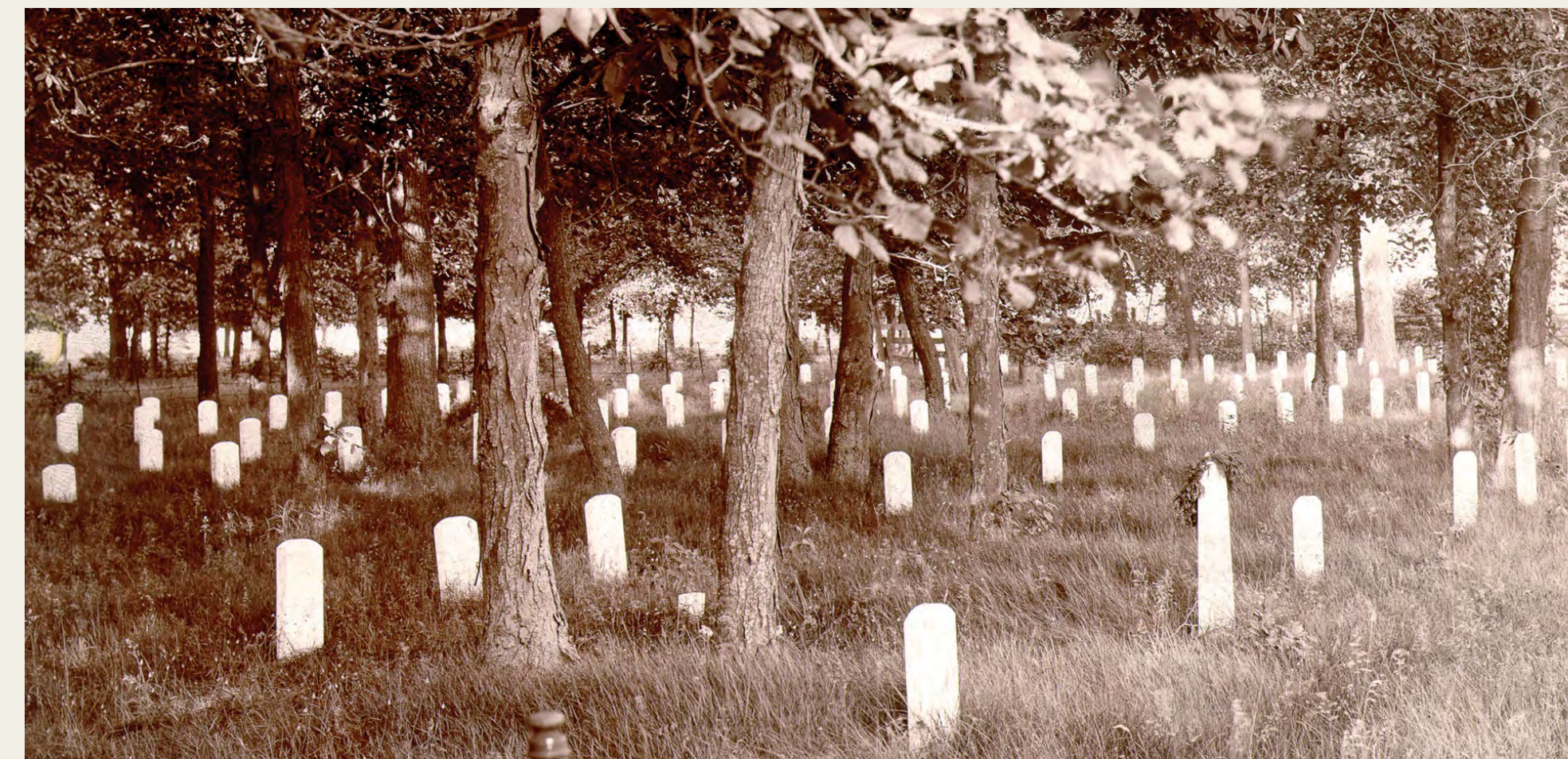
Confederate Stockade Cemetery, c. 1901.