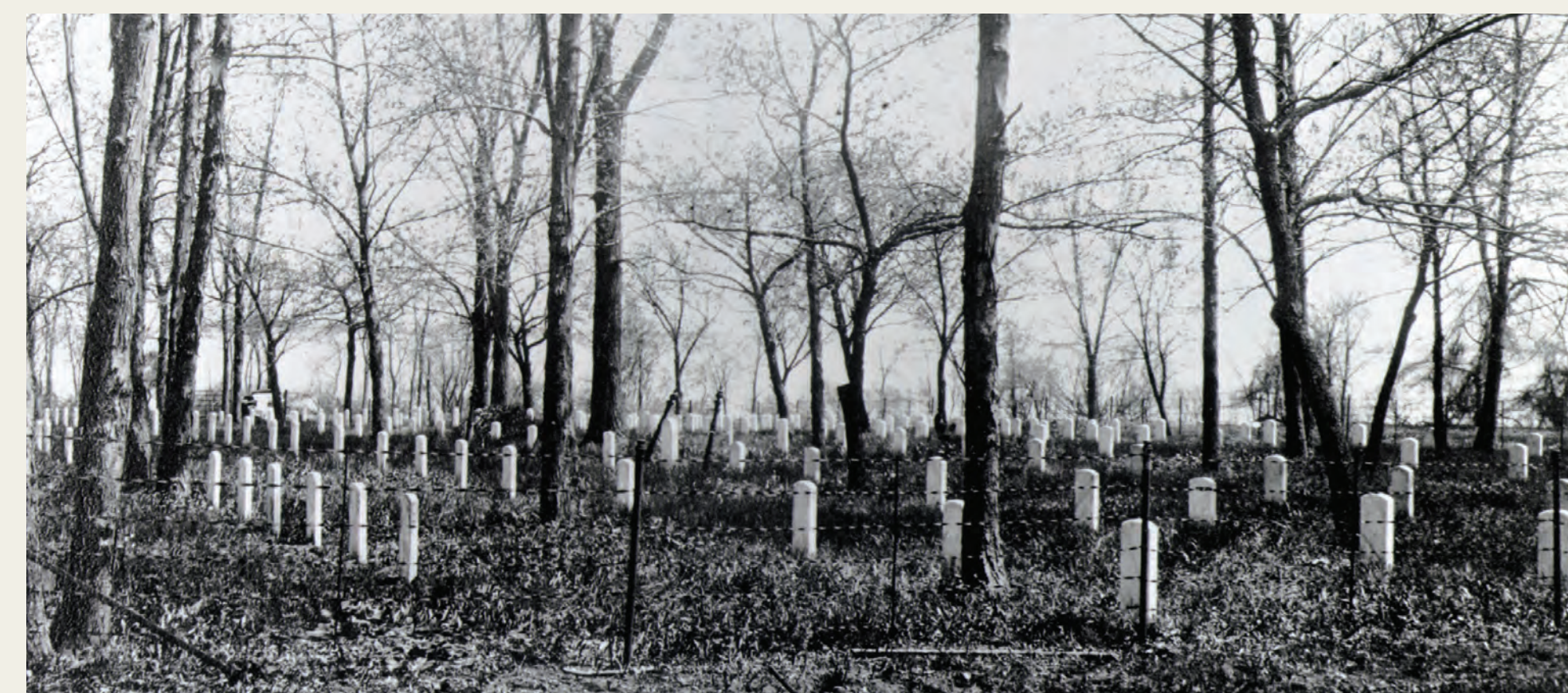
The cemetery after the headstones were placed, pre-1910.

After the war, friends or relatives removed more than twenty bodies. Marble headstones—206 total—were erected in 1890 through the efforts of a group of Georgia journalists who visited the cemetery and reported in state newspapers the lack of permanent markers. Many of these headstones remain in place today.