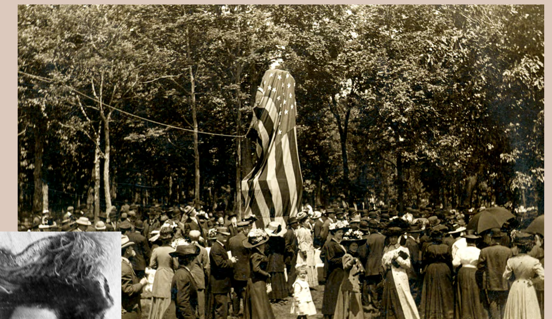
Unveiling "The Lookout" statue in 1910.