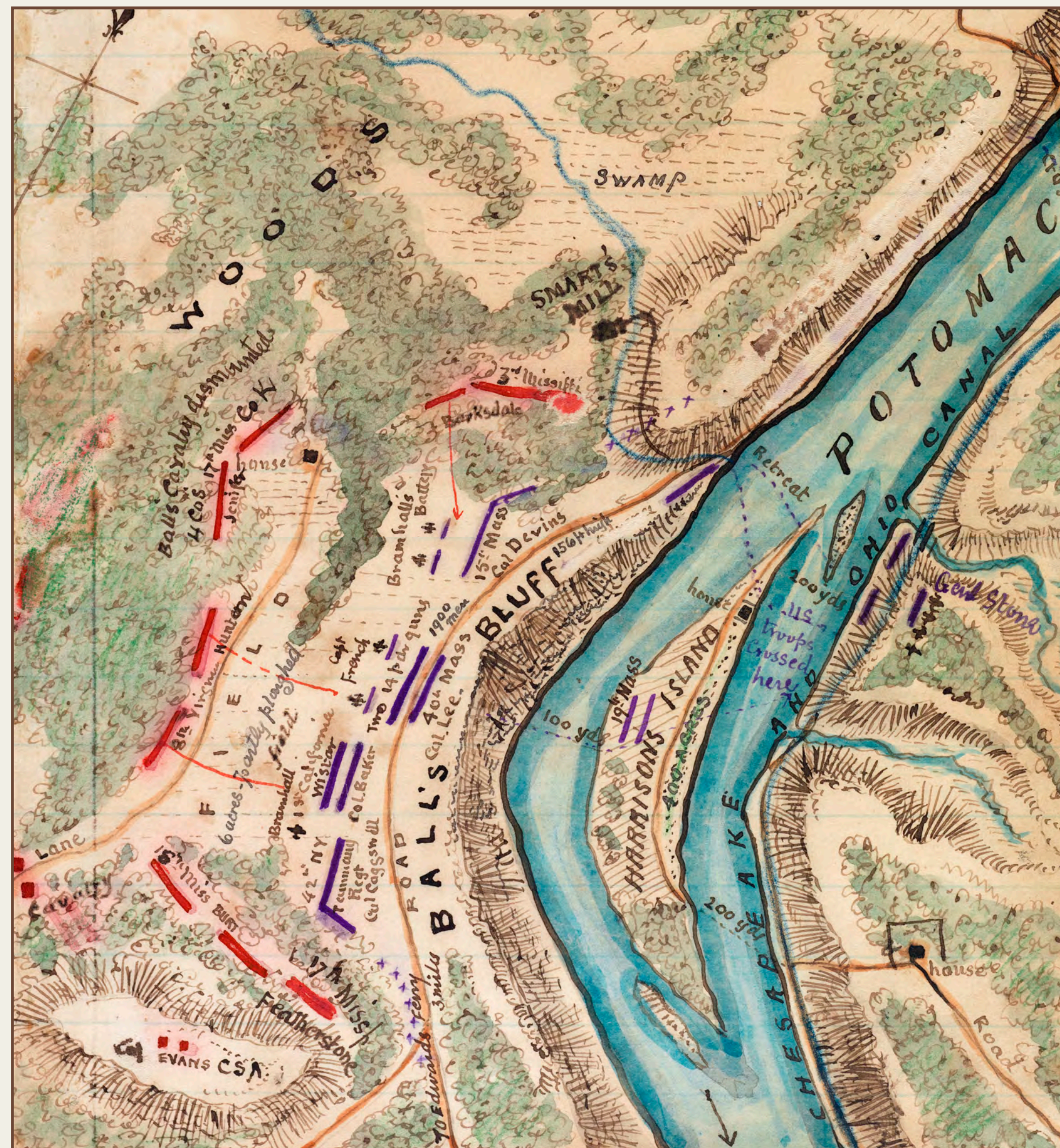
Robert Knox Sneden's map of the Battle of Ball's Bluff, 1861. Union forces are shown in purple, Confederate in red.

Early on the morning of October 21, Union forces crossed the river to attack what was reported to be an unguarded Confederate camp. Instead, they came upon Southern troops under the command of Confederate Col. Nathan "Shanks" Evans and fighting ensued.