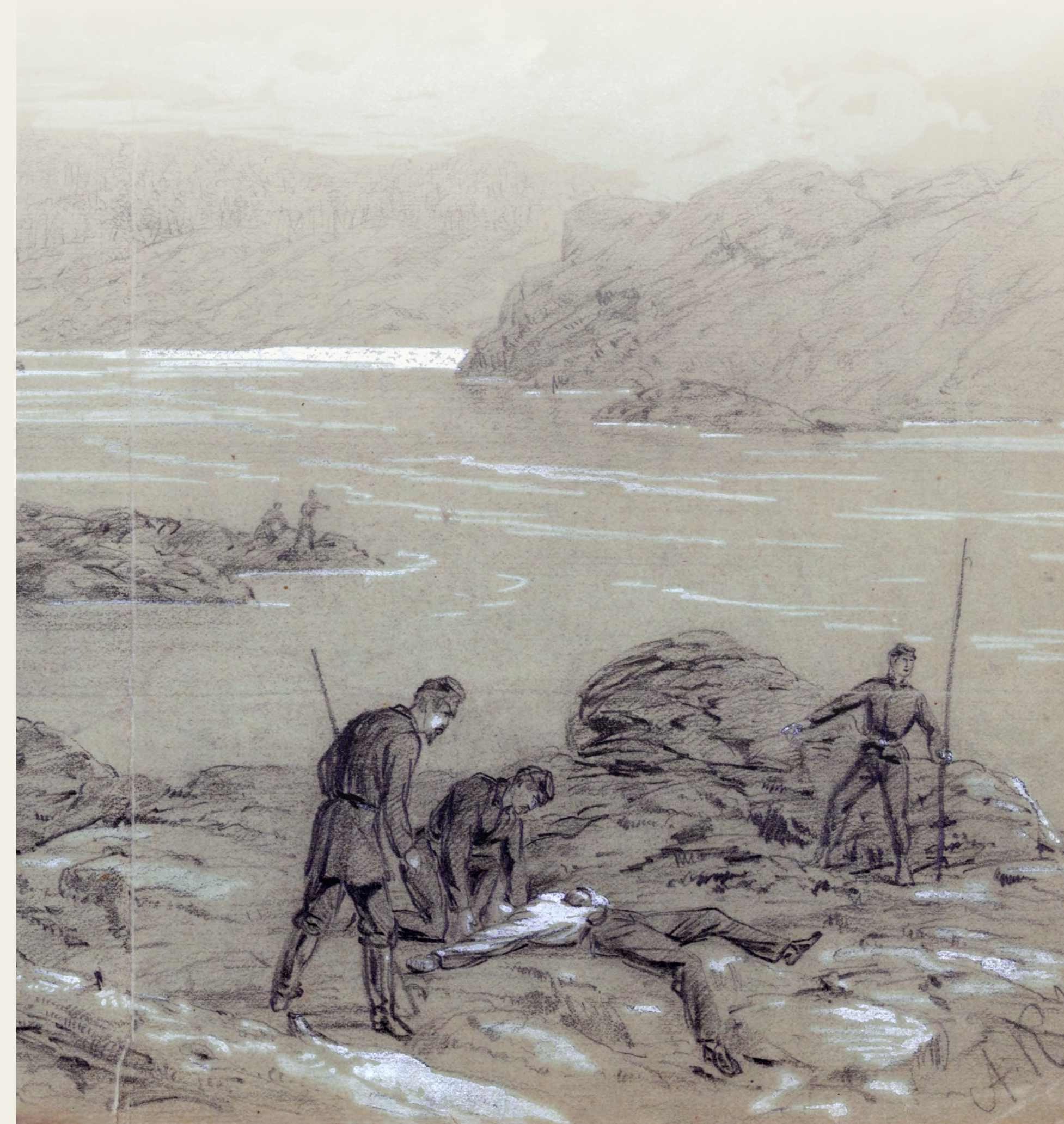
Union soldiers recover comrades' bodies from the Potomac River, c. 1861.