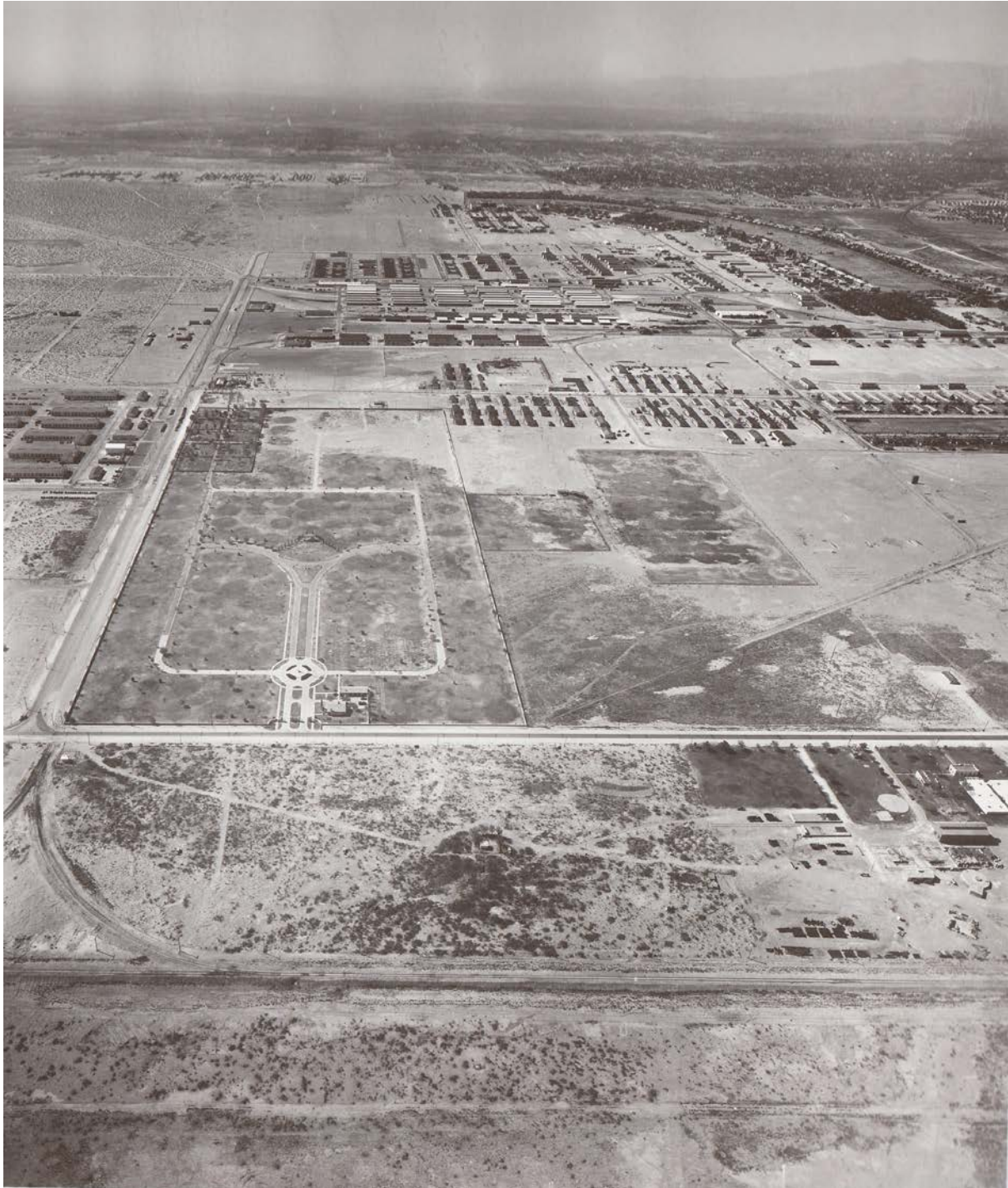
Fig. 2 Aerial view of cemetery grounds, 1948

Southwest of the entrance were the lodge, along with a parking lot and utility southwest of the building. A 1948 aerial view of the cemetery confirms that the plans in the rendering came to fruition (fig. 2)