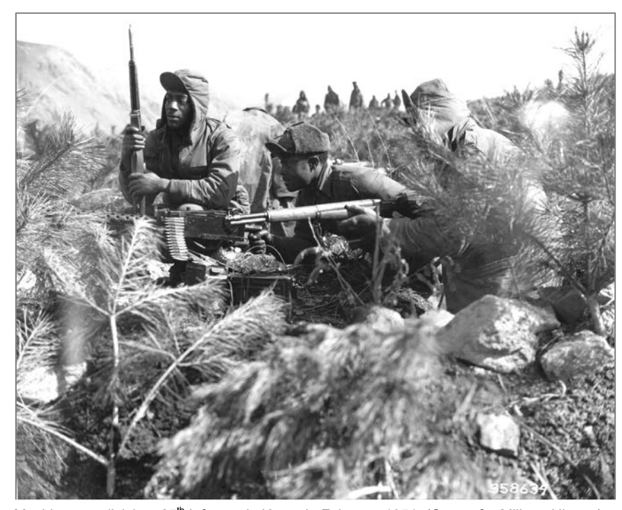
Machine gun division, 25<sup>th</sup> Infantry, in Korea in February 1951. (Center for Military History)

After the Port Chicago, CA, disaster in 1944, calls for the desegregation of naval forces led the army to deactivate its two all-black cavalry units. The 25<sup>th</sup> Infantry folded in 1947, but the 24<sup>th</sup> infantry continued in service. This regiment was among the first deployed after North