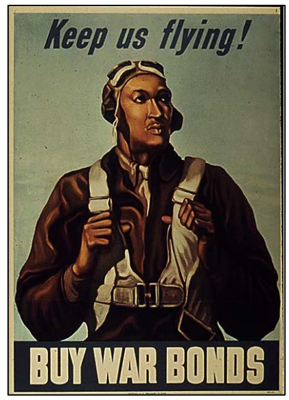
War bonds poster, 1943.

The Tuskegee Airmen served in the African-American flying units of the U.S. Army Air Forces during World War II, credited with 1,491 missions. They served as pilots, navigators, bombardiers, engineers, quartermasters, warrant officers, support and medical personnel, and instructors. However, until 1940, the U.S. military denied them the opportunity to fly. Thus the flight school at Tuskegee, AL, began as a civilian pilot-training program under the Civilian Aeronautics Administration. Engineering professors from Auburn University introduced the men to aviation; flight instruction took place at a municipal airport.