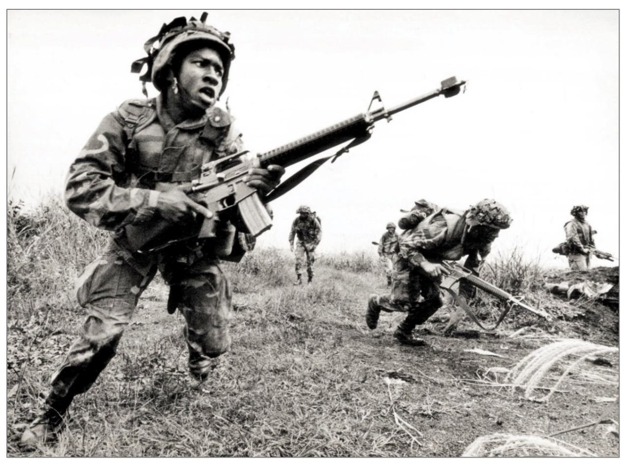
"Engaging the Enemy," 1969.