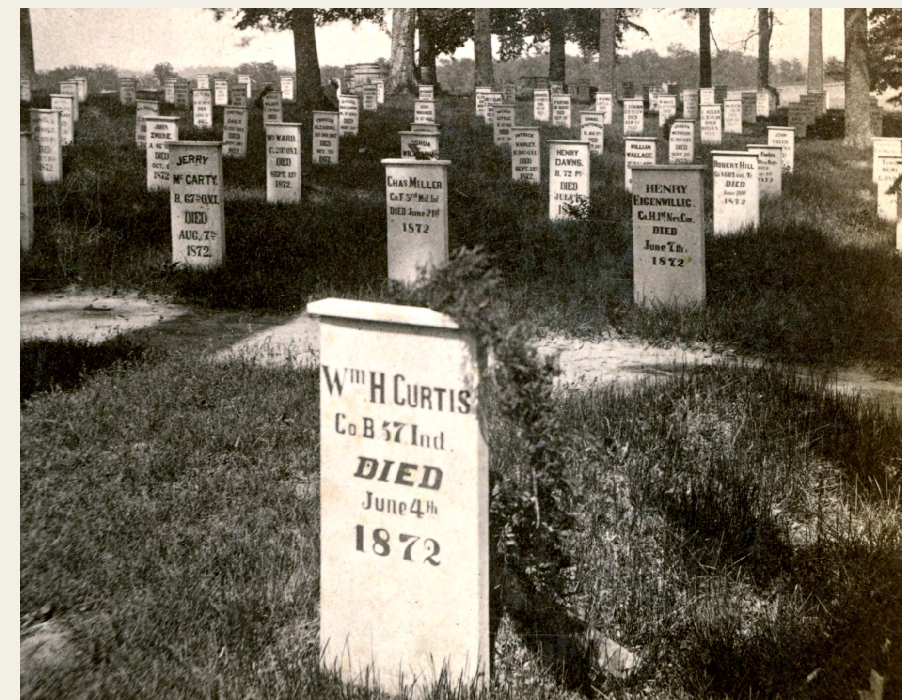
Temporary wooden headboards, c. 1870s. Civil War Army Medal of Honor (below).

Three Civil War recipients of the Medal of Honor are buried here. First bestowed in 1863, it is the highest award for military valor in the U.S. Armed Services. For acts above and beyond the call of duty, 1,522 individuals who served in the Civil War received the medal.