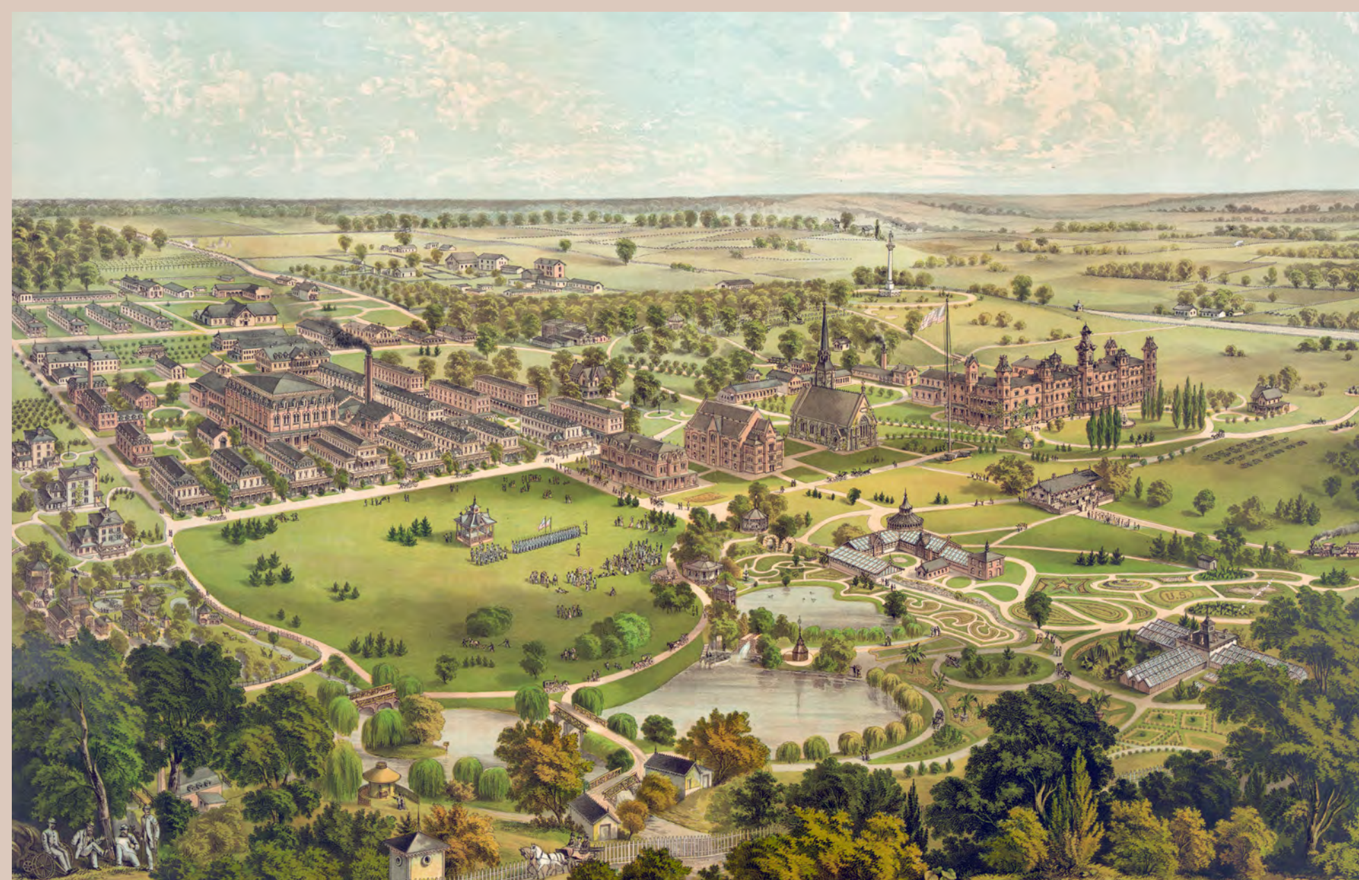
Central Branch, National Home for Disabled Volunteer Soldiers, c. 1877. The Soldiers Monument is visible in upper right. Library of Congress.